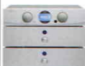
PRE/POWER AMPS Cairn Nitro/K1As £10,995 Page 103